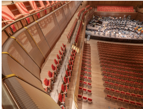
Picture 6: The GKD-fabric fits flexibly to the bidirectionally curved corners of the balustrade.