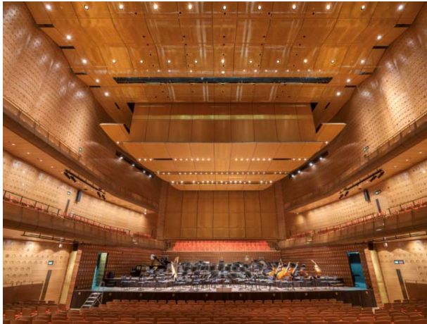
Picture 1: The ceiling and the back wall of the stage of the Koningin Elisabethzaal were clad with 1,600 square meter of the fabric Alu 6010 by GKD.