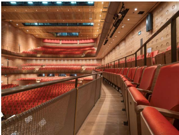
Picture 3: Reflectors clad in metal fabric by GKD as well as frames covered in the same fabric ensure a magnificent sound experience.