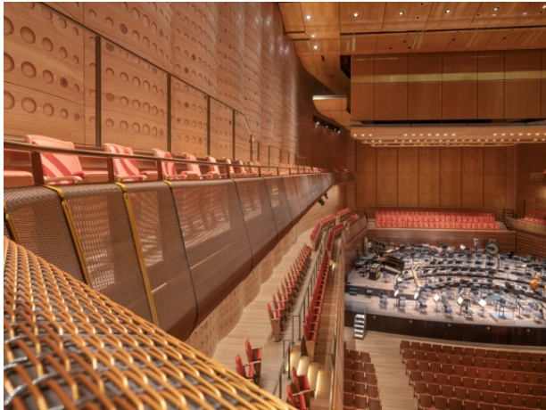
Picture 5: The golden GKD-fabric Omega 1520, which is resistant to impact thanks to tensioning, was chosen for the balustrades.

Konigin Elisabethzaal opts for wood and metal fabric in a shoe box