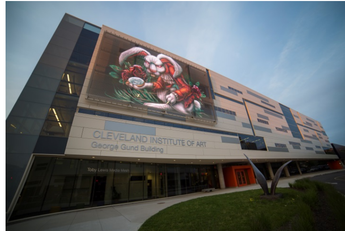
Picture 2: The transparent metallic fabric screen of GKD with integrated LED profiles allows a lot of daylight into the university's rooms, while also providing an unrestricted outward view from inside the building.