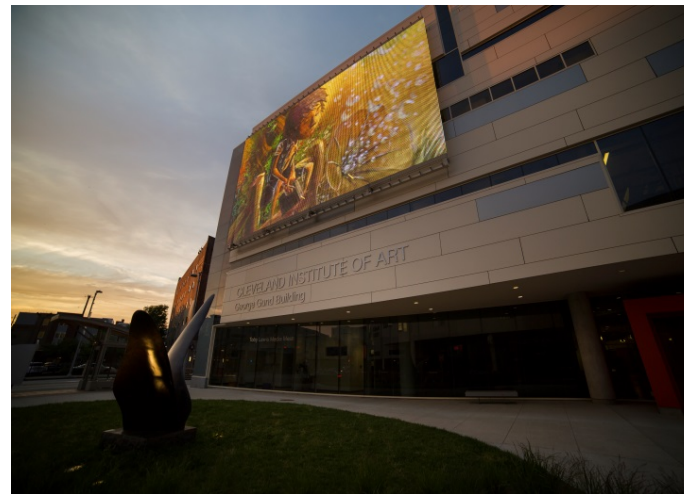
Picture 5: Four panels – each measuring 4 x 9.3 meters – form a bright display that serves as a presentation platform for student works.