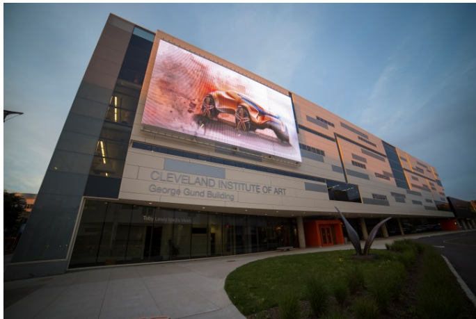
Picture 1: With its 71.680 pixels, the 150 square meter MEDIAMESH® screen by GKD guarantees crystal-clear display of graphics, photos and also video clips of the students.