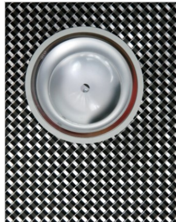
Picture 4: The ceiling systems allow lights and sprinklers to be integrated effortlessly thanks to recesses incorporated during production. Mesh: Atlantic.