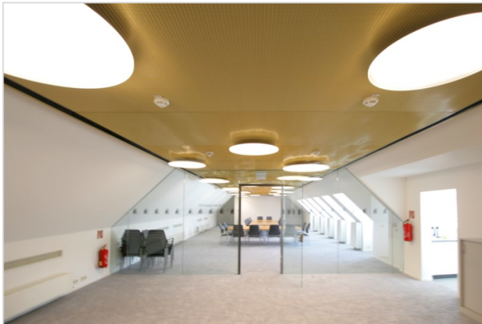
Picture 3: The ceiling system with CMP-Alu 6010 mesh ensures pleasant acoustics in the conference room of the “King of England” building in Stuttgart, Germany.