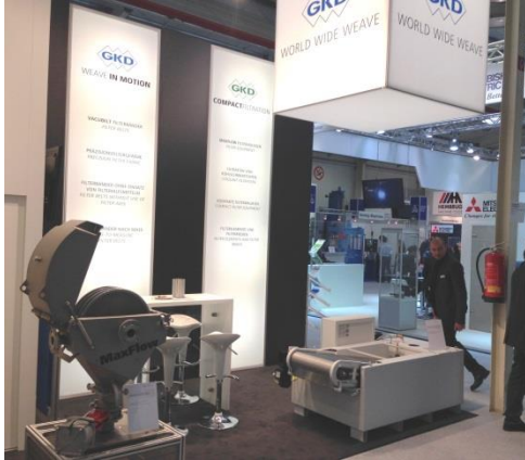
Picture 1: GKD attracted a broad specialist audience at the GrindTec 2014.